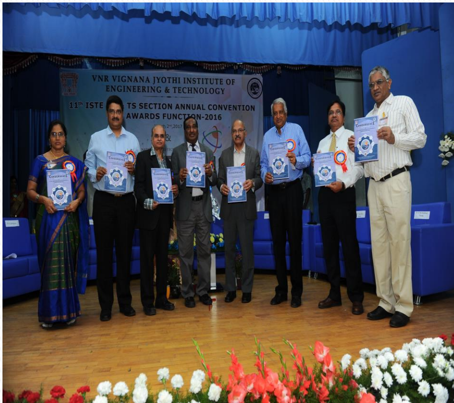
Releasing Souvenir and Report of Technical Fest Convergence 2k17

11 th ISTE AP&TS Section Annual Convention and Awards Function- 2016 held on 2 nd March, 2017 at VNR Vignana Jyothi Institute of Engineering & Technology, Hyderabad