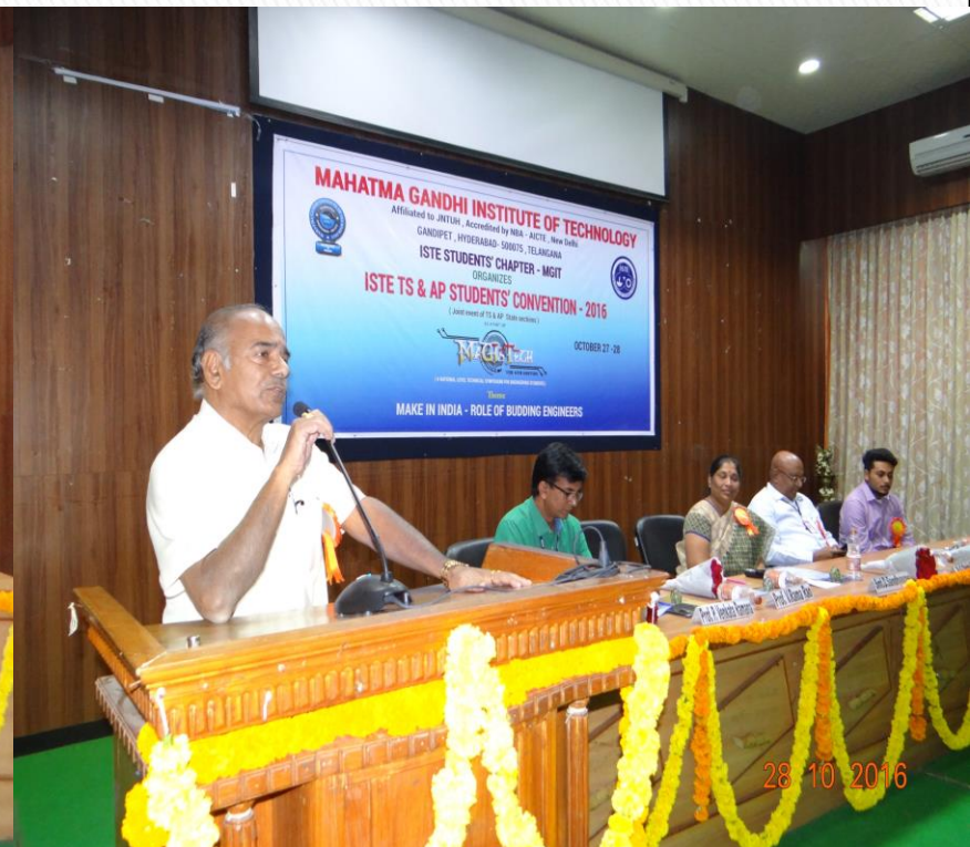
Release of Souvenir in the inaugural function of ISTE TS and AP Students' Convention on 27 th October 2016 at MGIT.